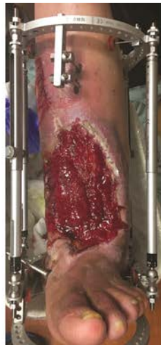
Fig. 8 Three week post-operative follow-up visit. Donor site is granular and ready for partial thickness skin graft