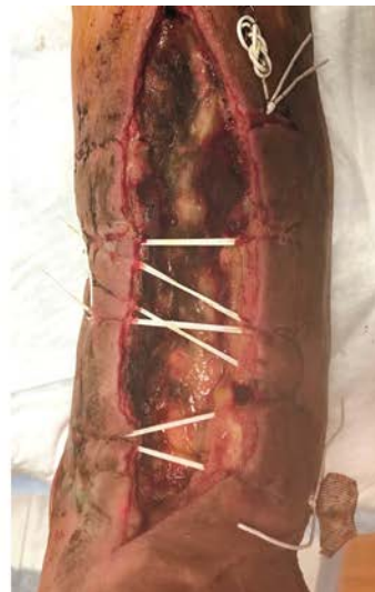
Fig. 2 Post-operative wound after removal of hardware at distal leg. After wound dehiscence, conservative therapies failed to reduce the size of the wound. The patient was left with a large, full thickness wound measuring 10.0 × 5.0 × 1.0-cm deep with mixed eschar, fibrinous tissue, and unhealthy granular tissue