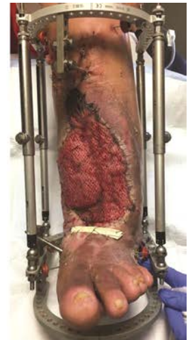
Fig. 10 Post-operative follow-up at one week status post partial thickness skin graft application