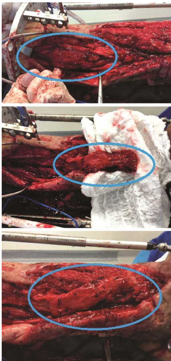
Fig. 4 The medial soleus muscle was identified and removed from its origin at the proximal leg and transposed to the distal leg deficit

The wound was covered with an Integra Bi-layer Matrix Wound Dressing and fixed accordingly to manufacturers specifications ( Fig. 5 ). The Integra Bi-Layer Matrix is comprised of a porous matrix of cross-linked bovine tendon collagen and glycosaminoglycan and a semi-permeable polysiloxane (silicone) layer. This graft was used to 1) provide a semi-permeable membrane to control vapor loss and acting as a bacterial barrier, and 2) provide a scaffold for cellular invasion and capillary growth. In time, the matrix would be remodeled; rebuilding the damaged site while simultaneously degrading the collagen-GAG matrix.