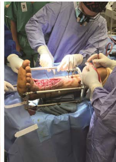
Fig. 3 After debridement of the surgical wound, an Orthofix TrueLok Trauma Frame was utilized to immobilize the surgical site to prevent traction to the arterial perforators to the soleus muscle; maintaining vascular viability of the muscle flap. One full ring, one foot plate, and adjustable struts were used