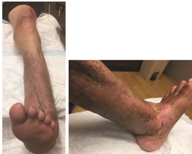
Fig. 15 Five months status post soleus muscle flap. Cosmesis has improved due to soleus muscle flap atrophy