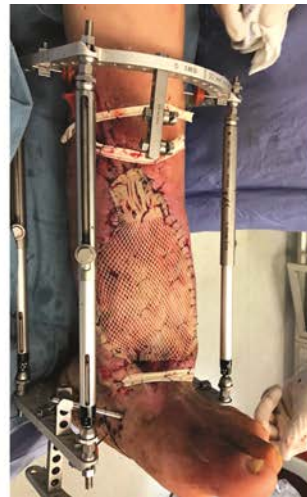
Fig. 9 Intra-operative photo utilizing a 0.018 inch partial thickness skin graft from the medial thigh. Vessel loops served as a skin buffer from retention stitches