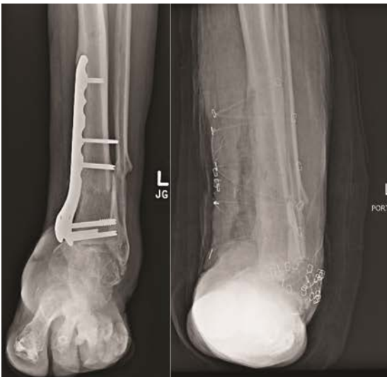
Fig. 1 Patient has retained hardware from surgical correction of rigid cavovarus foot deformity. The hardware subsequently became infected years later after the patient developed a wound that tracked to the ankle. The hardware was surgically removed

Next, a longitudinal incision was performed extending from the anterior leg wound to the medial proximal leg. Incision was deepened to the level of the fascia with care being taken to identify and retract all vital neurovascular structures. Extensive fibrosis of underlying tissue was noted. All bleeders were cauterized and tied as necessary. The surgical site was flushed with copious amounts of hydrogen peroxide to assist with hemostasis. The fascia of the medial soleus muscle was identified and transected. The muscle was identified and removed from its origin in the proximal leg. After ensuring adequate bleeding, the muscle belly was transposed to the distal leg deficit and sutured in place with absorbable suture on a taper needle, adequately covering the wound defect ( Fig. 4 ).