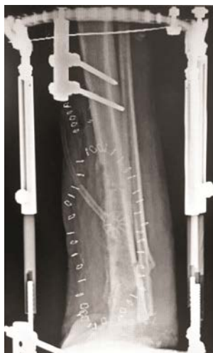
Fig. 11 Post-operative radiograph film status post partial thickness skin graft. The Orthofix TrueLok Trauma Frame was formed with two half pins and wire at the tibial support and one half pin and two wires at the midfoot. Corresponding fixation pins were inserted into the leg and foot and tension appropriately