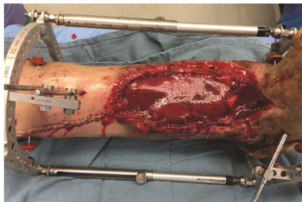
Fig. 5 An Integra Bi-Layer Matrix was utilized to control the vapor loss of the wound, act as a bacterial barrier, and provide a scaffold for cellular invasion and capillary growth

The wound was covered with an Integra Bi-layer Matrix Wound Dressing and fixed accordingly to manufacturers specifications ( Fig. 5 ). The Integra Bi-Layer Matrix is comprised of a porous matrix of cross-linked bovine tendon collagen and glycosaminoglycan and a semi-permeable polysiloxane (silicone) layer. This graft was used to 1) provide a semi-permeable membrane to control vapor loss and acting as a bacterial barrier, and 2) provide a scaffold for cellular invasion and capillary growth. In time, the matrix would be remodeled; rebuilding the damaged site while simultaneously degrading the collagen-GAG matrix.