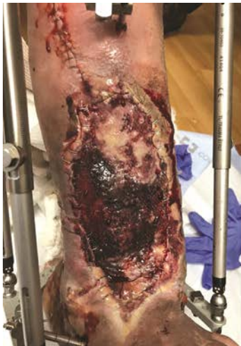
Fig. 7 One week post-operative follow-up visit. A hematoma developed under the Integra Bi-Layer Matrix. This graft was fenestrated and wound VAC was re-applied

and healing of the wound (Fig. 12). Healing was achieved in three months, which at this time, the external fixation device was removed and a compression dressing with posterior splint was applied (Fig. 13). Four months status post procedure, the patient was ambulating in a patella tendon bearing orthosis. A noticeable soleus muscle bulge was still present (Fig. 14). This bulge atrophied in time as shown by five month operative pictures (Fig. 15).