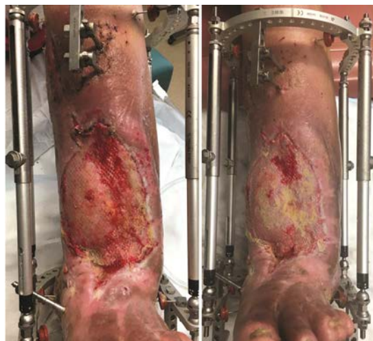
Fig. 12 Two and three weeks status post partial skin graft application