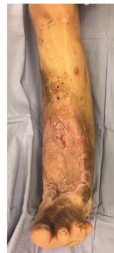
Fig. 13 Three months status post original soleus muscle flap, the external fixation device was removed