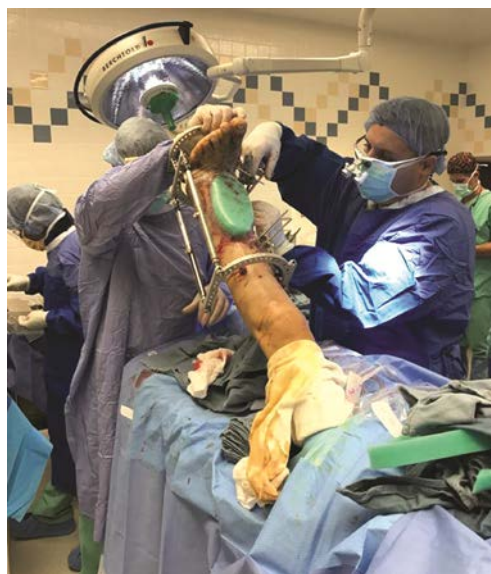
Fig. 6 A wound VAC was utilized and set at 70 mmHg and continuous flow. Wound VAC was applied for one month to ascertain the viability of the muscle flap and readiness for partial split thickness skin graft

The proximal leg incision was then re-approximated with 3-0 Vicryl and skin staples. The Integra graft was then covered with a wound VAC and set at 70 mmHg and continuous flow. Wound VAC was applied for one month to ascertain the viability of the muscle flap and readiness for partial split thickness skin graft ( Fig. 6 ).